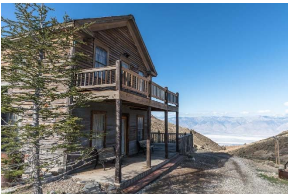
California Hotel in Cerro Gordo. You can own it.

https://boingboing.net/2018/06/11/for-sale-1-california-ghost.html