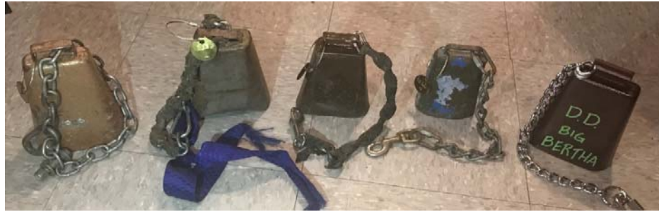
From left to right cowbell 1, 2, 3, 4 and 5